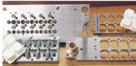
YOGHURT CUTTING TOOLS