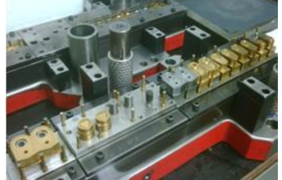
HIGH PRECISION TAB DIE TOOL ENHANCED LIFE USING HIGH PERFORMANCE COATINGS

Hofmann Metaltec has a vast experience in providing engineered solutions to various food packaging companies.