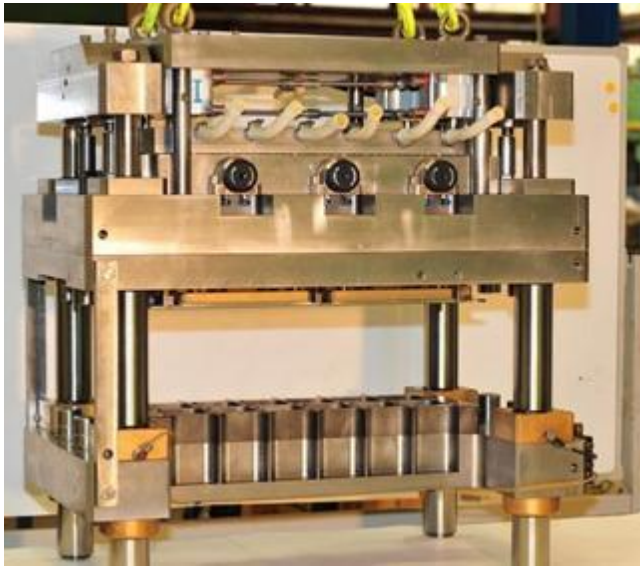
YOGHURT CUTTING TOOLS PRODUCT IMPROVED - TOOL STROKE LIFE DOUBLED