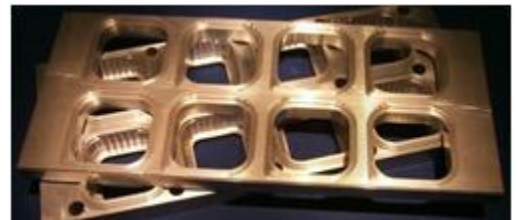
THERMO FORM TOOLING