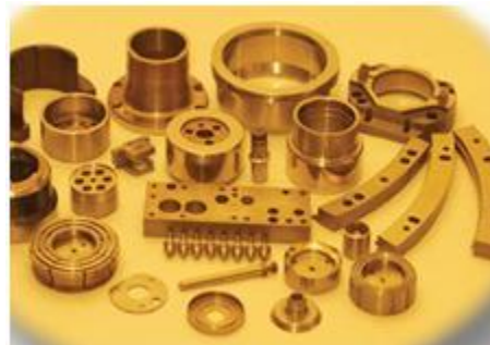
CAN MAKING TOOLING