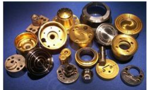
FOOD & BEVERAGE CAN TOOLING