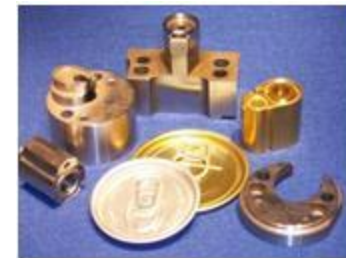
PRODUCT IMPROVED TAB DIES TITANIUM COATED FOR LONGER SERVICE LIFE