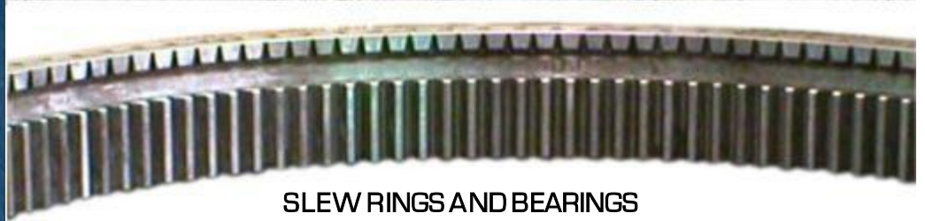
SLEW RINGS AND BEARINGS

Since 1969 Hofmann Engineering has provided specialist engineering services to Australia's industry leaders.