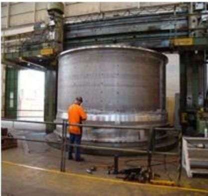
Plate UT examination to AS 1710 Flange plate Z property tensile tested. Welded and tested to AWS D1.1 Stainless Steel to AWS D1.6 available.